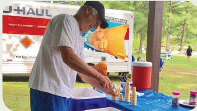
YOUNG AND OLD ALIKE ENJOYED OUR 2016 ICE CREAM SOCIAL!