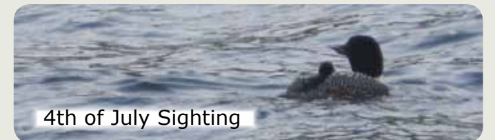
4th of July Sighting

On a final note, we are happy to announce that the town has once again approved $10,000 towards our cause of thwarting the introduction of aquatic nuisances. Remember, prevention is still our only defense against these invasive species.